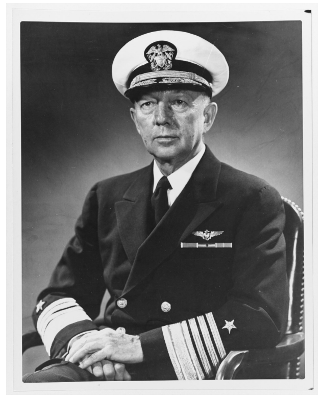
Admiral Donald B. Duncan.

Admiral Donald B. Duncan retired on March 1, 1957. Duncan died on September 8, 1975, in Pensacola, Florida.