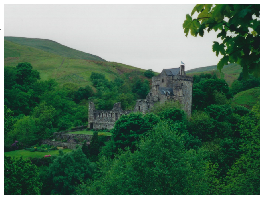
Castle Gloom, Dollar, Clackmannanshire. May 30, 2001.

From the roadside Craighall Castle appears to be no more than the typical Scottish