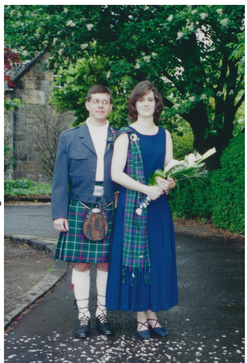
The wedding at Alloa, Clackmannanshire. May 30, 2001.