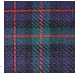
Atholl District Tartan.

In addition, we have the option to wear the well known Perthshire regimental tartan, the Black Watch, as our clan is based in Perthshire. Another option is to wear the Atholl District tartan. The Atholl tartan is one of the earliest known district tartans with the earliest known reference to it being around 1619. The current Atholl District design was published by Wilsons of Bannockburn in 1819. It is peculiar to the district of Atholl and is not defined to a specific clan. This is not the same as the Murray of Atholl tartan.