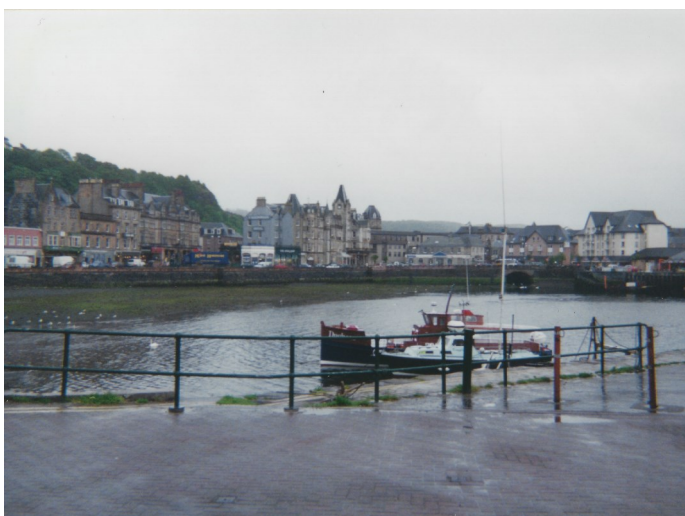
Oban, Argyll. June 1, 2001.

After breakfast and conversation with an English couple seated nearby, we walked about the Oban waterfront and purchased two tickets for the 12:00pm ferry from Oban to Craignure. With about an hour and half to kill, we continued our exploration of Oban, purchasing flower seeds at a local garden shop. Back at the terminal, we queued up and waited in the rain until the Caledonian McBrayne was ready to board. We claimed a seat by a window and I repaired to the bar area for a Tobermory and thence to the cafeteria for a hot mocha coffee for Chris. We lounged below deck long enough to dispose of these and then went upstairs to see the sights. The rain continued, but braving it was well worth it for the magnificent views afforded from above. A ruined tower loomed in the mist as we exited the bay and