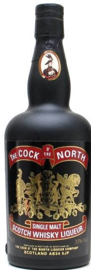
Cock O’ the North.

Another asset which should benefit the category is the current cocktail revival, dating from the mid-1990s and continually accelerating, which has brought various liqueurs to the fore. Some whisky liqueurs are already thriving based on greater versatility, whether served over ice or as a cocktail ingredient. Moreover, we tend to be more experimental when drinking cocktails, and consequently more prepared to try something unfamiliar. This means that cocktails provide a prime opportunity for liqueurs to be “discovered,” and then, hopefully, valued for their own merits.