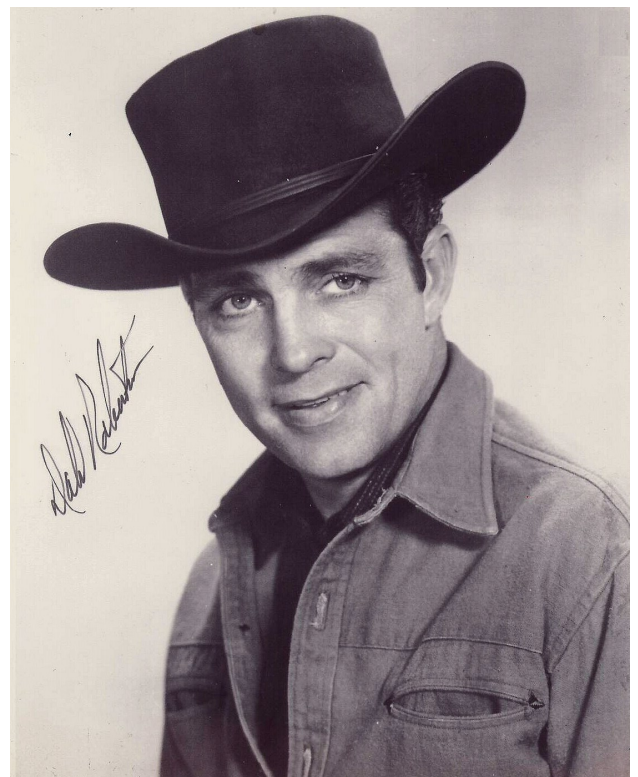
Dale Robertson.