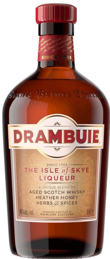
Drambuie.