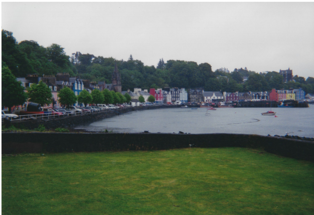
Tobermory, Mull. June 1, 2001.

disappointed. The restaurant featured seafood, of course, and a view of the chefs in the kitchen preparing the meals of patrons at break-neck speed. An army of waitresses worked all tables at once. We dined upon Dungeness crabs and langoustines and sauntered back in the direction of the Beechgrove. We decided we were not yet ready to call it a day, entered O'Donnell's Irish Bar near the hotel, and settled in at the only available table, next the men's room. We listened to a band playing American pop and classic rock covers, drank a few pints, and headed home.