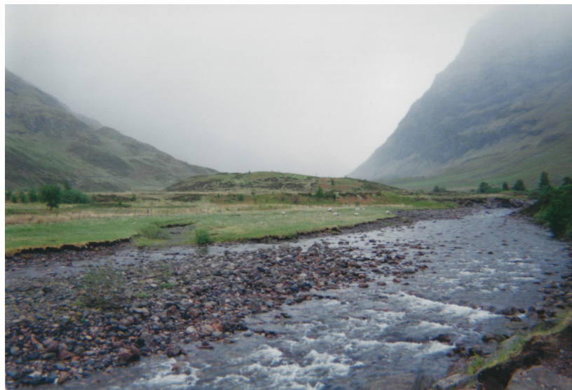
Glen Coe, Ballachuilish, Argyll. May 31, 2001.