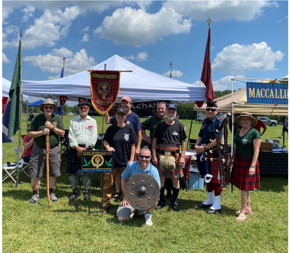
Clan Donnachaidh at the Green Hill Highland Games.

To all of our clanfolk and friends who stopped by, thank you! Your attendance made it a very enjoyable day for all of us and we plan to host a clan tent here again next year!