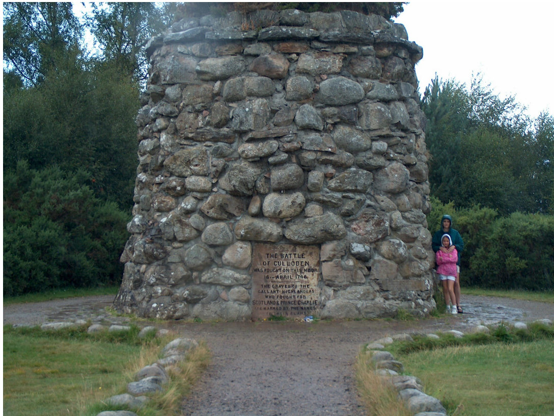
Battle of Culloden Monument, Culloden Moor, Inverness, Scotland. August 2003.

Parent Society membership dues are $25.00 per year (individual) and $35.00 per year (family = two persons/same address). Mid-Atlantic Branch membership dues are $20.00 per year (individual).