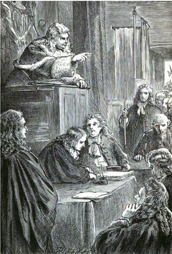
Judge Jeffries at the Bloody Assizes.

In Scotland, Archibald Campbell (9th Earl of Argyll) returned to Scotland and led a parallel rebellion to Monmouth's Rebellion (May-July 1685). After several false starts in raising his clansmen in Argyll, he found that his campaign was in danger of collapse as a large army led by the Marquess of Atholl had entered Argyll. The Earl's army of clansmen melted away. The Earl was captured and imprisoned in Edinburgh castle. Because he was already under a prior sentence of death, the Earl was beheaded on June 30, 1685 in Edinburgh. Many of Argyll's followers made their escape to Ulster in Ireland.