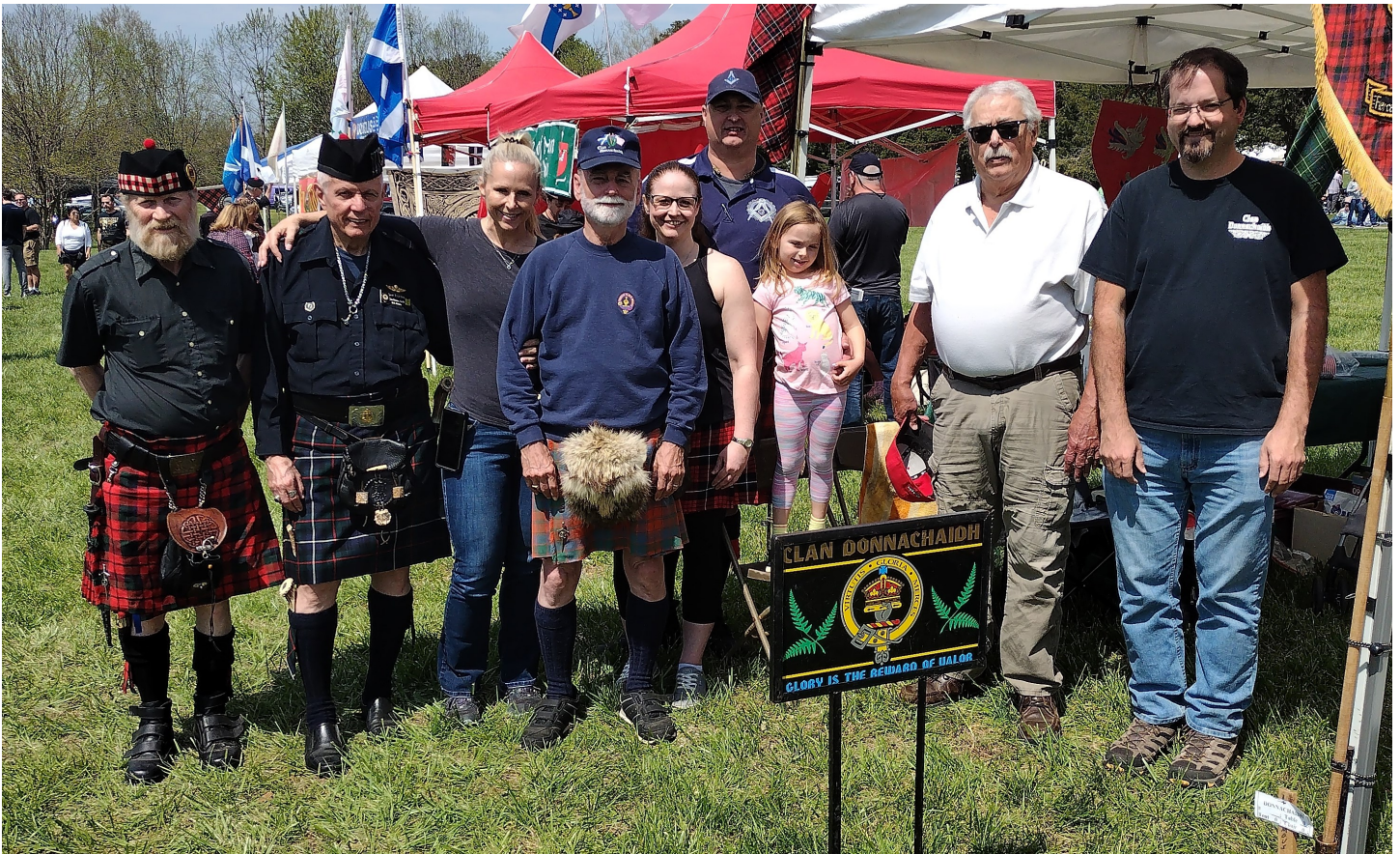
Clan Donnachaidh at the Southern Maryland Celtic Festival and Highland Games.